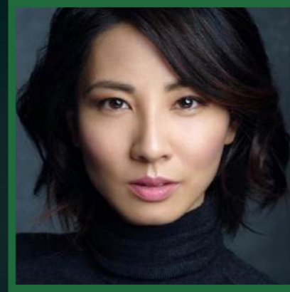
Jing Lusi as Dr. Marie Lau