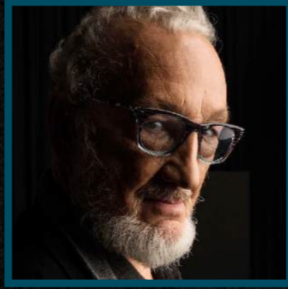
Robert Englund as Randall